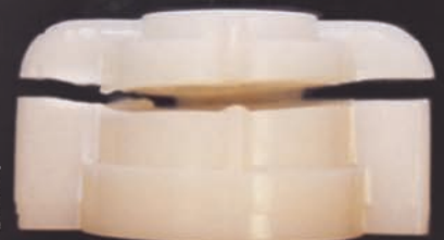
Water Fitting Fracture